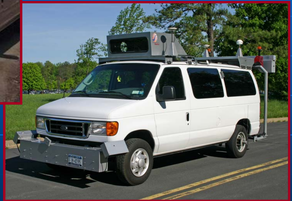
Depth of Rutting measurement