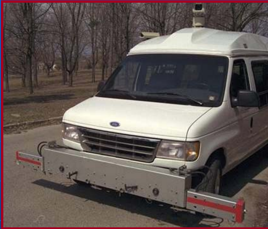
Transverse Profile measurement