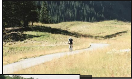
Near Vail Pass

Trails placed alongside river beds or other poor soil locations are susceptible to differential settling, heaving, and wash out. Asphalt is not nearly as expensive to repair or replace as concrete because grinding and slab replacement costs are avoided. If a proper preventive and corrective maintenance program is established, asphalt maintenance costs can be kept to a minimum, resulting in easier to maintain pavements.