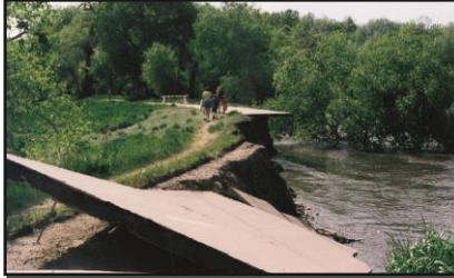
Concrete trail collapsed on Poudre River near Ft. Collins