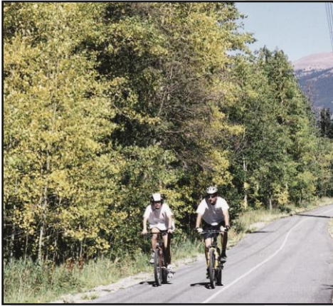
Ten Mile Creek Trail (Frisco / Copper Mountain)