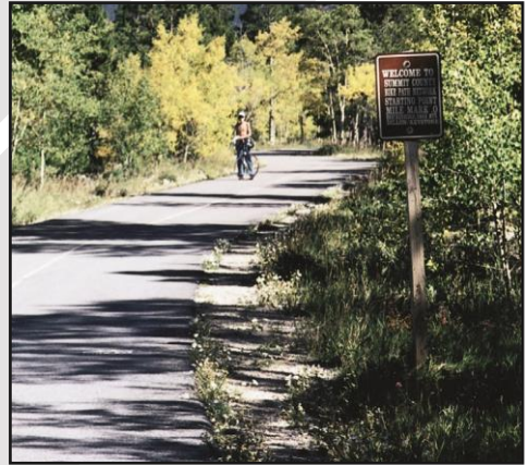
Summit County Bike Path

Asphalt pavement construction techniques allow it to be placed on minor slopes and blended into the existing topography. In addition, many users are preserving the natural setting of trails by customizing their color through the use of polymer pigment or with colored aggregates. This color enhancement allows an asphalt trail to blend in more naturally with its environment.