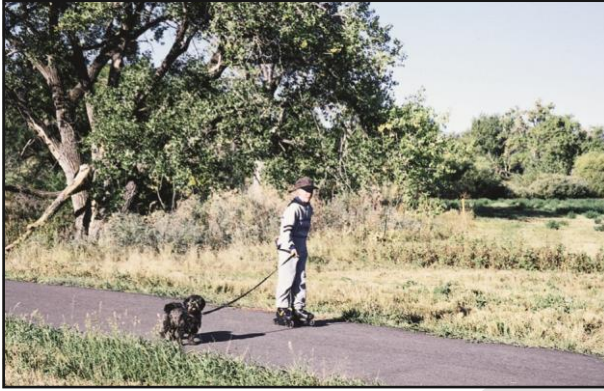
Columbine Trail, Arapahoe County